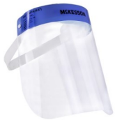
Face Shield #11913